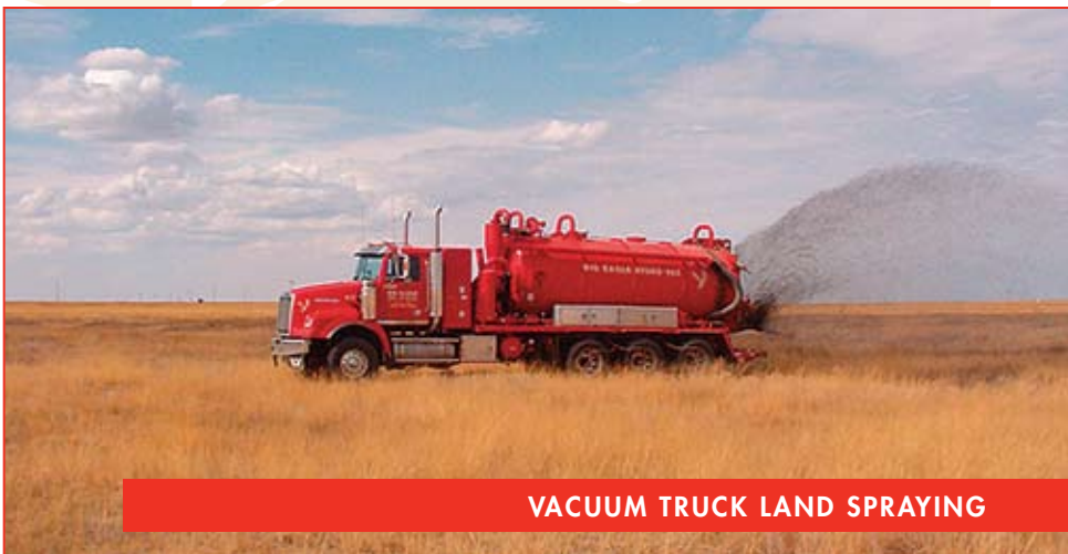
VACUUM TRUCK LAND SPRAYING

A state-of-the-art GPS system allows all vehicle activity to be monitored for field application and safety purposes. The system records: activity reports, fleet proximity, idle time, individual truck or fleet locations, speed, travel time and distance. Information on an individual truck, groups of trucks or the entire fleet may be brought up on a screen by dispatch or supervisors as required.