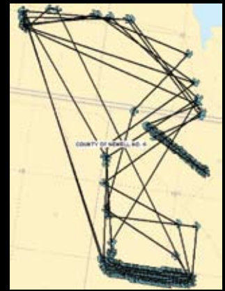
GPS TRACKING OF SPREAD FIELD