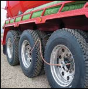
TIRE PRESSURE CONTROL TPC SYSTEM