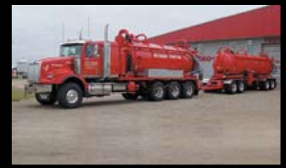
TRI-AXLE VACUUM TRUCK WITH QUAD WAGON