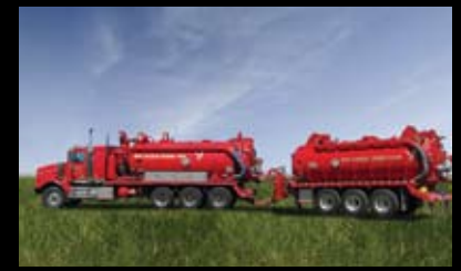
TRI-AXLE VACUUM TRUCK WITH A TRI-AXLE STIFF POLE PUP