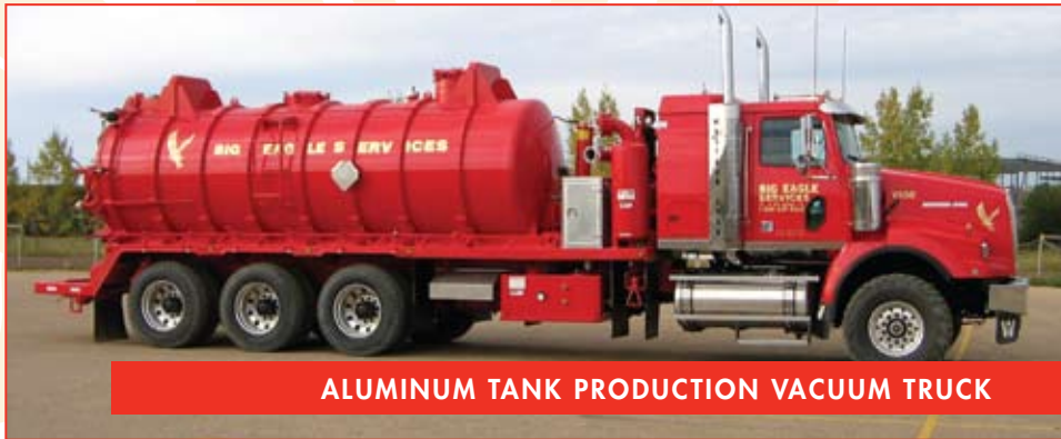
ALUMINUM TANK PRODUCTION VACUUM TRUCK

All units are certified to B620-09 standards to meet regulations throughout British Columbia, Alberta and Saskatchewan. Our trucks with steel or aluminum tanks are capable of transporting approximately 6 - 11 m 3 of product. All production units are equipped with 4" and 6" load valves that are certified air actuated spring-applied safety valves providing diverse capabilities. A pressure compensated hydraulic system controls the blower, minimizing froth and over-pressure situations and fully isolated vacuum tanks allow for transportation of any material safe from leakage and spills. All of our units are equipped with emergency safety shutoffs for the truck engine, load valves and isolation systems.