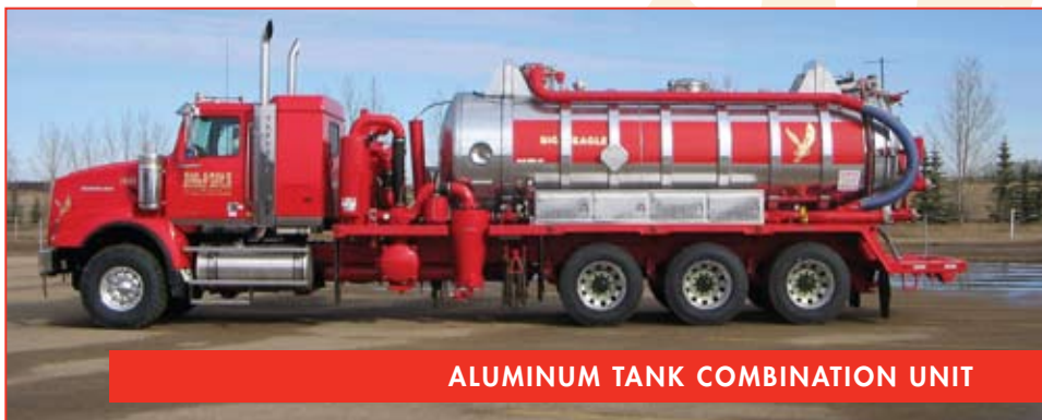
ALUMINUM TANK COMBINATION UNIT

Similar to our Production Vacuum trucks, our Combo units are certified to B620-09 regulations. They are tested in certified inspection facilities, capable of transporting 6 - 11 m 3 of product, and are equipped with 4" and 6" load valves, air actuated spring applied safety valves, a pressure compensated hydraulic system controlling the blower, isolated vacuum tanks and emergency shutoffs for the engine, load valves and isolation systems.