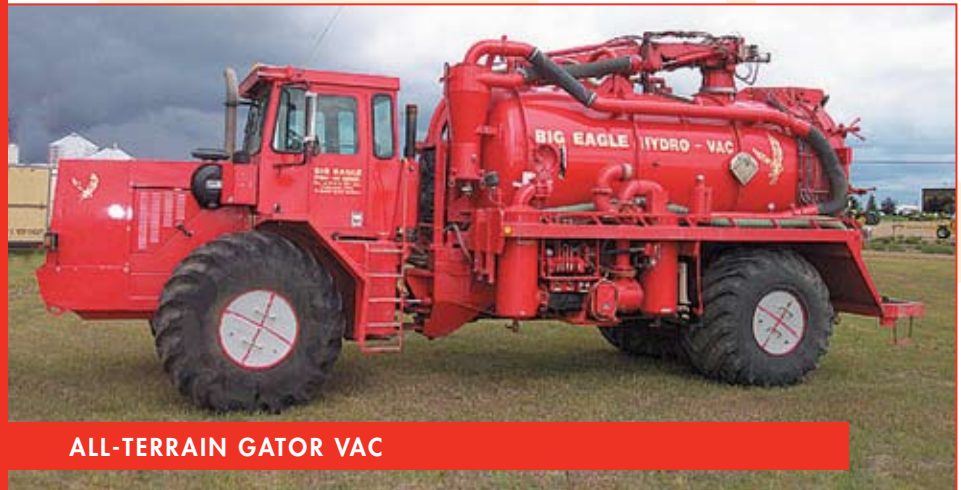
ALL-TERRAIN GATOR VAC

Big Eagle's Vacuum division encompasses many different types of Vacuum trucks to suit every project. Semi and Combination units can be used for bigger jobs such as sumps or major cleanups. Even the most extreme and severe conditions can be overcome by the All-Terrain Gator Vac. All Big Eagle's Vacuum trailers are capable of being self-contained or tied into on site services, for our customers' convenience.